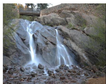
Garden of the Gods